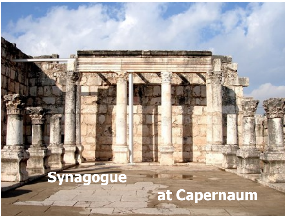
Synagogue at Capernaum