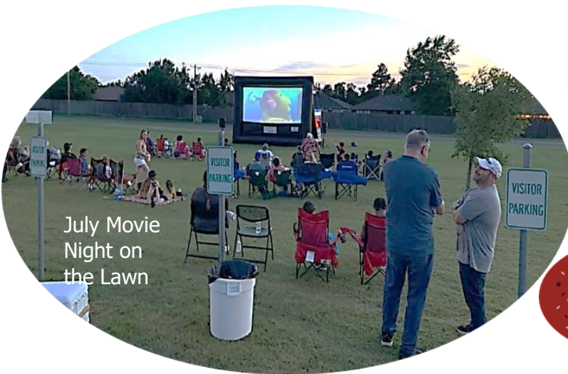
July Movie Night on the Lawn