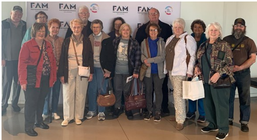
Our Young at Heart group took a trip to the First Americans Museum. Watch the counter for what they'll have next!

THE IS NO POWER IN THE CROSS OR TOMB ON ITS OWN - BUT IT LIES IN THE ONE WHO DIED ON IT & WALKED OUT OF IT! AND HE CALLS YOU FRIEND... JOHN 20:1-18